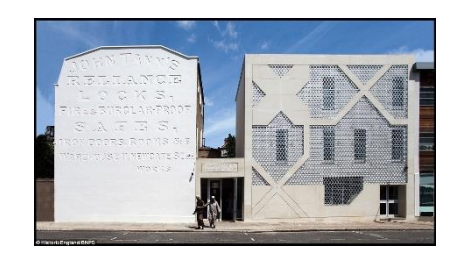
Shahporan Mas jid and Islamic Centre Trust - A converted lock-making factory