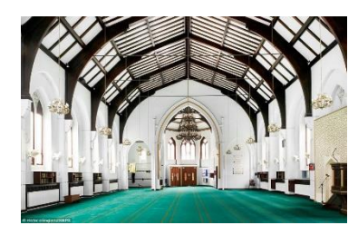
Didsbury Mosque — A converted Methodist Chapel